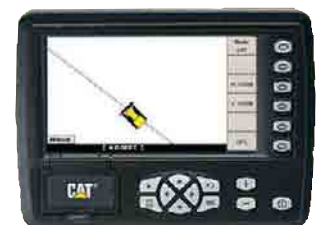
AccuGrade GPS Display