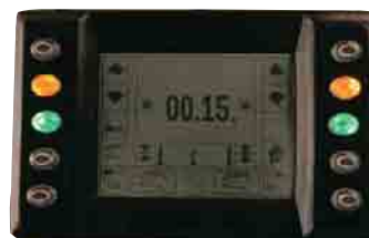
AccuGrade Laser Display