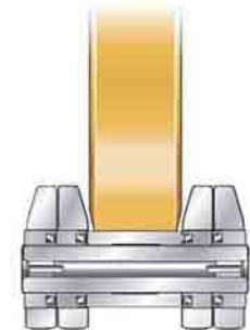
SystemOne Center Tread Idler